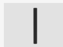
Palo H47 Bruco